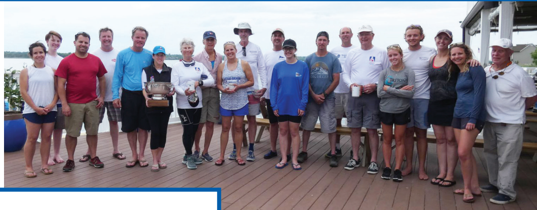
Masters Championship Sailors