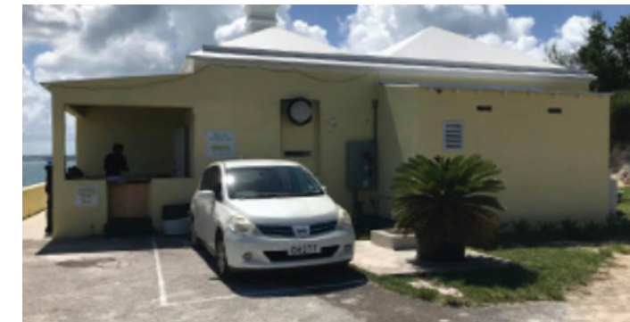
West End Sailboat Club, Bermuda

Albert Symond Regatta, West End Sailboat Club Sunday, April 28, 2019