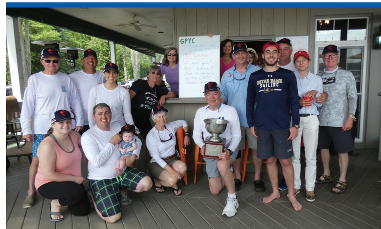
Happy Sailors at the Randall DeLeeuw